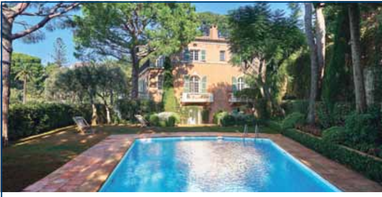
FRENCH RIVIERA, ST-JEAN-CAP-FERRAT Waterfront setting ♦ elegant villa of 450 m<sup>2</sup> ♦ 5 bedrooms ♦ sea views ♦ mature Guide €11.9 million

Guide €2.8 million Savills International Alison Hojbjerg ahojbjerg@savills.com +44 (0)20 7877 4704